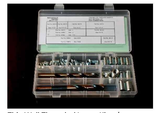
Thin Wall Threaded Insert Kit w/ LaserBest Drill Bits