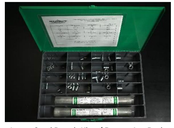
Large Stud Repair Kit w/ Brutus Arc Rod